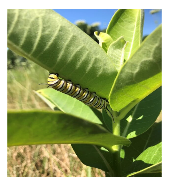
Figure 29. Asclepias (milkweed) provides a strong habitat for the various stages of a Monarch butterfly.