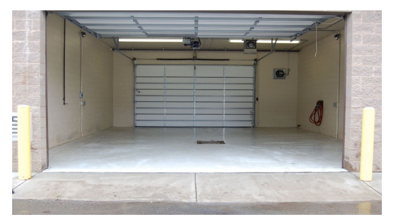
Figure 4. Construct floors of seamless metal or concrete sealed with a chemical-resistant paint.