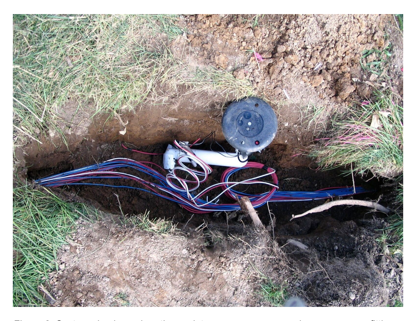
Figure 8. System checks and routine maintenance on pumps, valves, programs, fittings, and sprinklers should follow the manufacturer's recommendations.