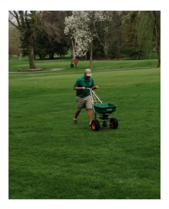
Figure 13. Proper fertilizer management reduces nutrient runoff.