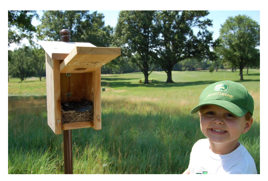
Figure 34. Golf courses proved exceptional habitats for various bird species such as bluebirds and wrens.

An environmental landscape design approach addresses environmentally safe and energy-saving practices; therefore, environmentally sound landscape management is also economically important. Non-play areas require a mix of sun and shade, optimal soil conditions and adequate canopy air movement to sustain growth and function.