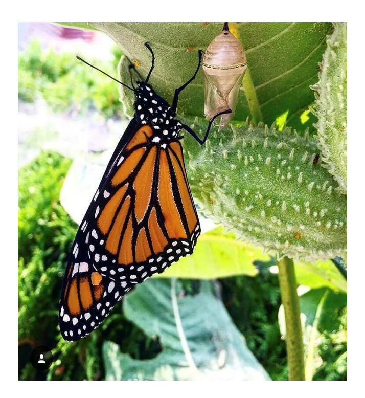
Figure 31. Monarch butterfly adult on an Asclepias (milkweed) plant.