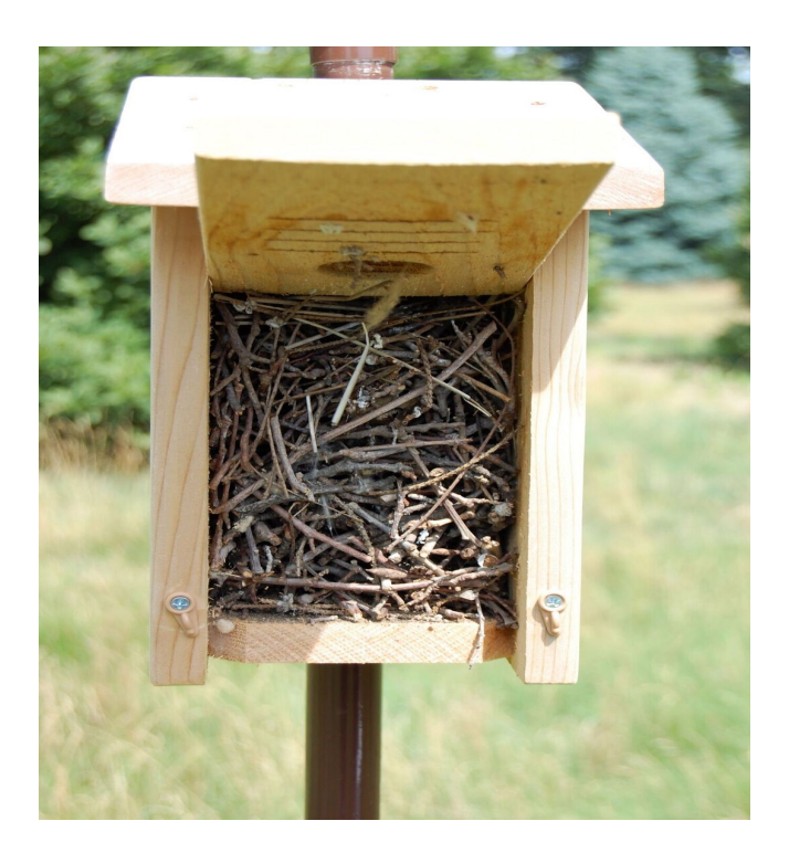
Figure 37. Wren nest found in custom made birdhouse. These custom-made birdhouses are a common site on Ohio golf courses.