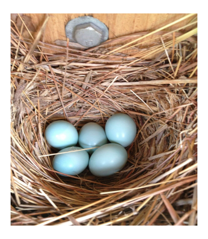
Figure 35. Bluebird eggs in custom made bluebird house. Similar birdhouses are found on many golf courses throughout Ohio.