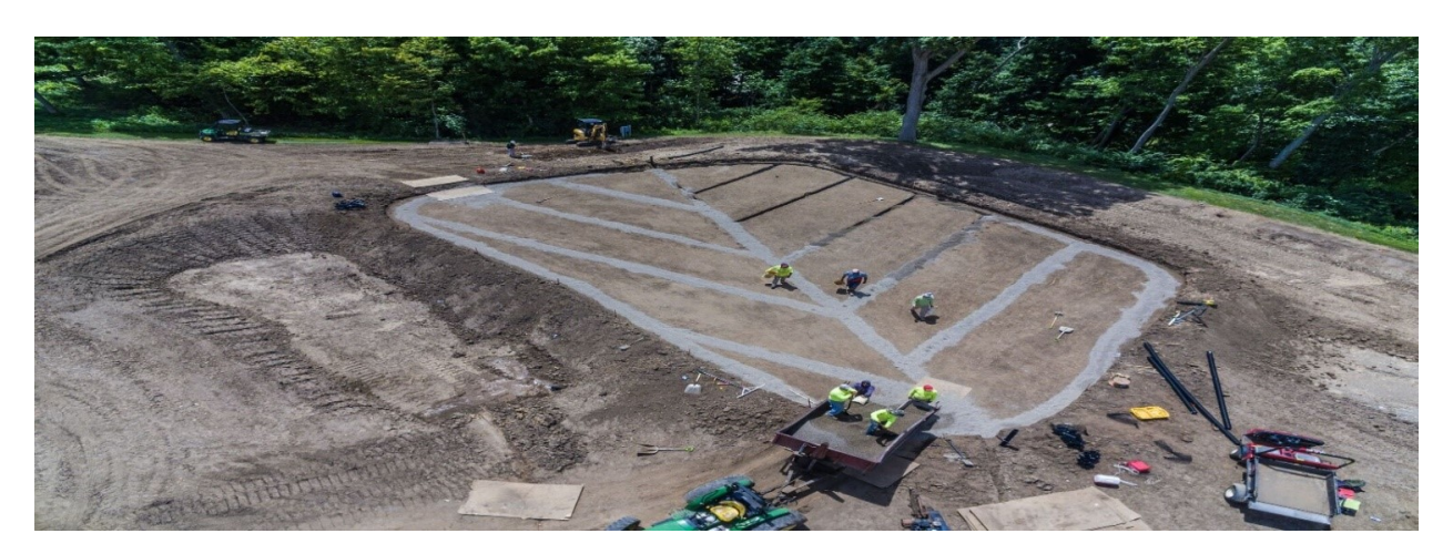
Figure 3. When constructing drainage systems, pay close attention to engineering details such as subsoil preparation, the placement of gravel, slopes, and backfilling.