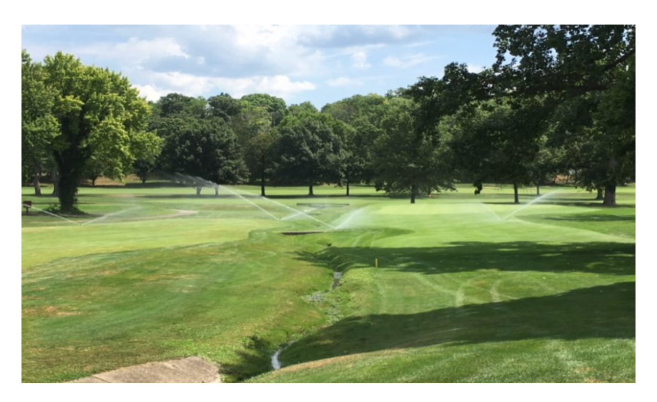
Figure 11. Irrigation rates should be based on ET rates and soil moisture replacement.