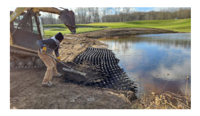
Figure 9. Pond bank stabilization products should be installed where possible to prevent bank erosion.