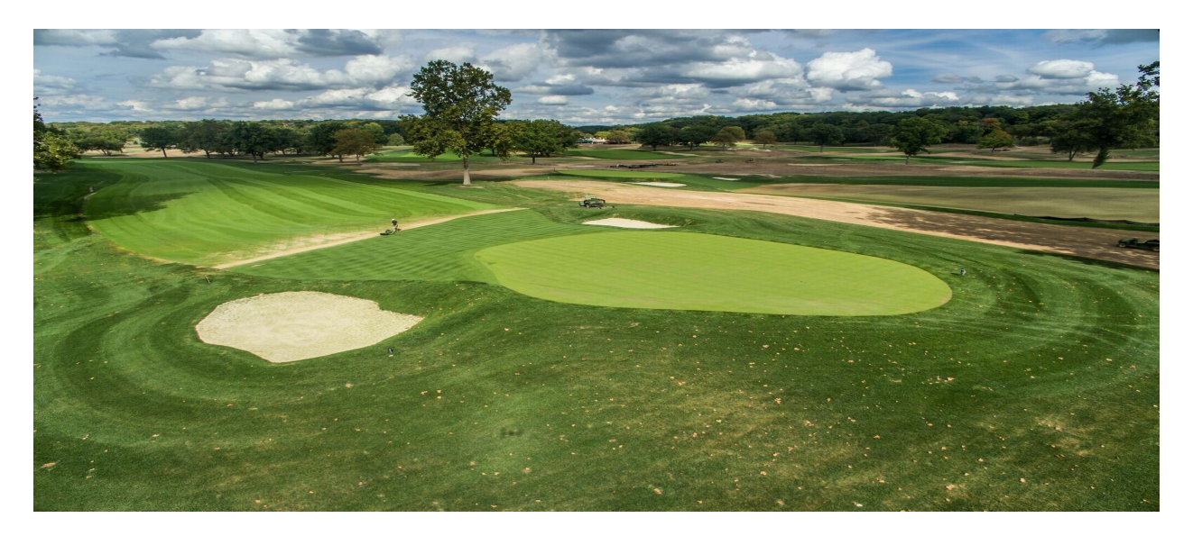
Figure 23. IPM focuses on the basics of identifying the pests and choosing pestresistant varieties of grasses and other plants.

• Determine whether the corrective actions actually reduced or prevented pest populations, were economical, and minimized risks. Record and use this information when making similar decisions in the future.