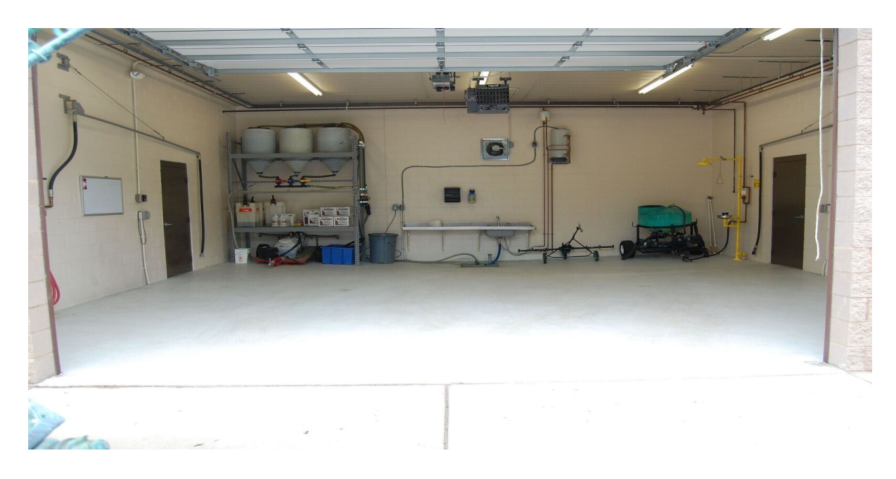
Figure 26. Store, mix, and load pesticides away from sites that directly link to surface water or groundwater.