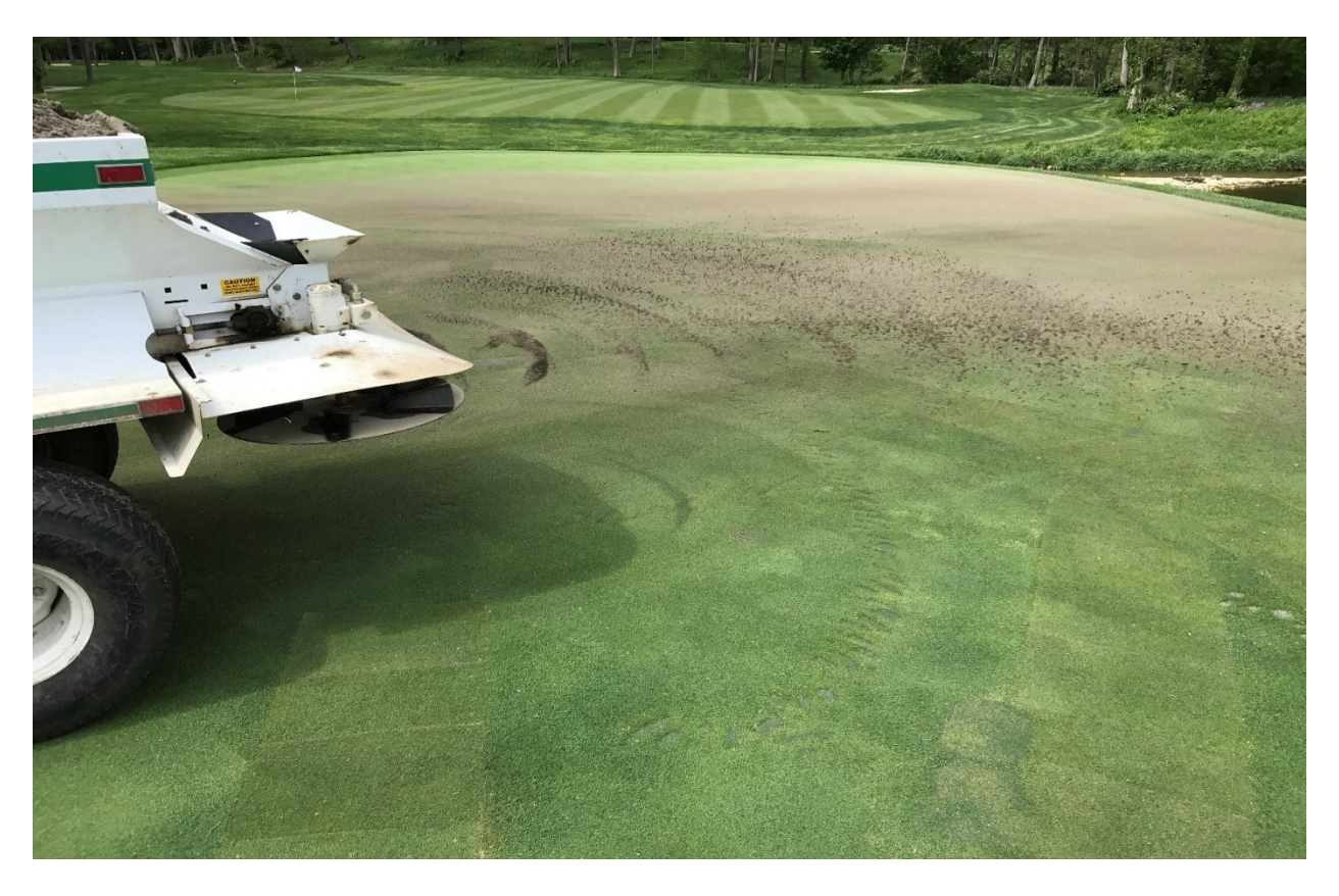
Figure 18. Applying light and frequent applications of sand can smooth playing surfaces and reduce thatch.