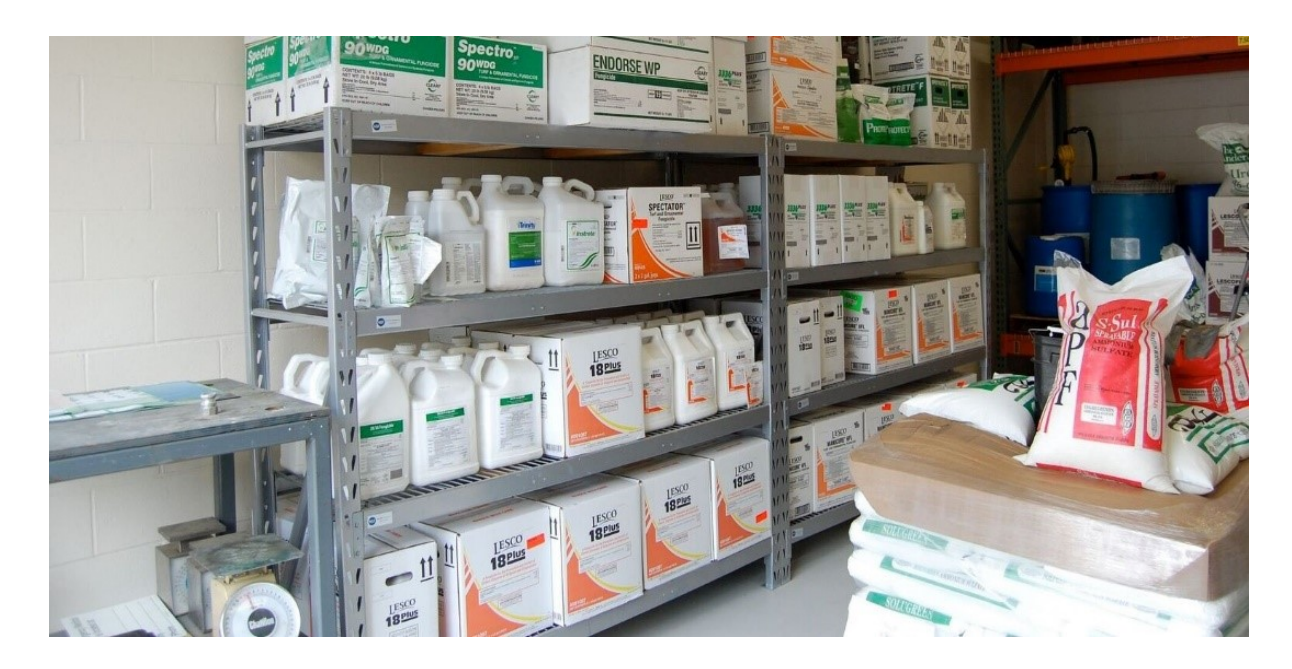
Figure 25. Always read the pesticide label in its entirety before mixing, loading or applying a pesticide.