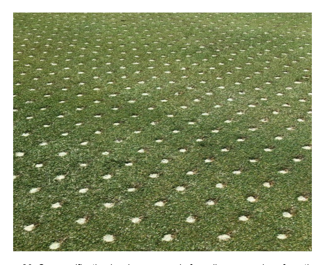
Figure 20. Core aerification involves removal of small cores or plugs from the soil profile. Annual core aerification programs should be designed to remove 15%-20% of the surface area.