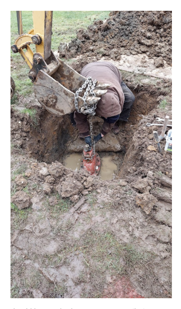
Figure 10. Valves should be repaired as necessary so that proper maintenance of the irrigation system can be performed.