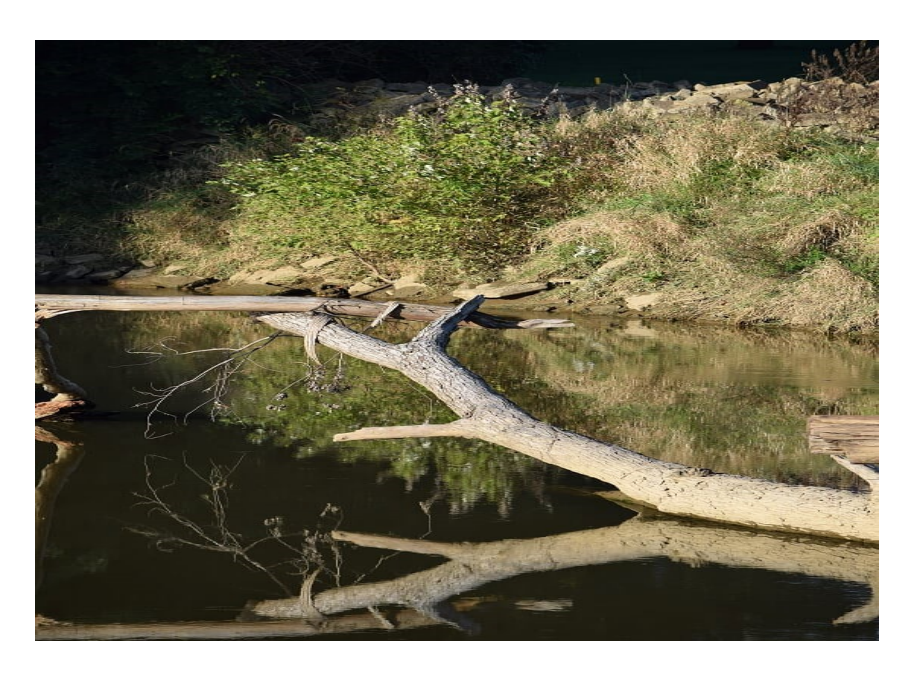
Figure 38. Fallen trees in out-of-play areas can provide various wildlife habitats.

mature. Plants within areas that are not in play or are not critical to the design of the course may be removed and replanted with native plant material that requires little to no maintenance after establishment. Additionally, 50% to 70% of the non-play areas should remain in natural cover. As much natural vegetation as possible should be retained and enhanced through the supplemental planting of native trees, shrubs, and herbaceous vegetation to provide wildlife habitat in non-play areas, along water sources to support fish and other water-dependent species. By leaving dead trees (snags) where they do not pose a hazard, a well-developed understory (brush and young trees), and native grasses, the amount of work needed to prepare a course is reduced while habitat for wildlife survival is maintained.