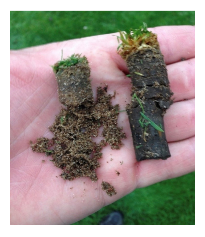
Figure 15. Through proper sampling, laboratory analysis, interpretation of results, recommendations, and record keeping, soil testing can be used to manage nutrients more efficiently.