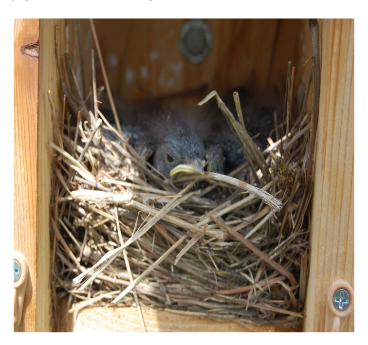
Figure 36. Bluebird fledglings found in custom made bluebird house.