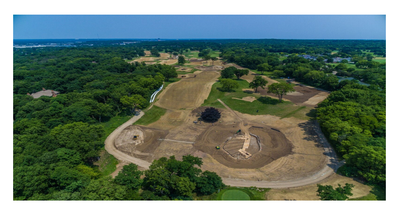
Figure 1. Schedule construction to allow for the most efficient progress of the work, while optimizing environmental conservation and resource management.