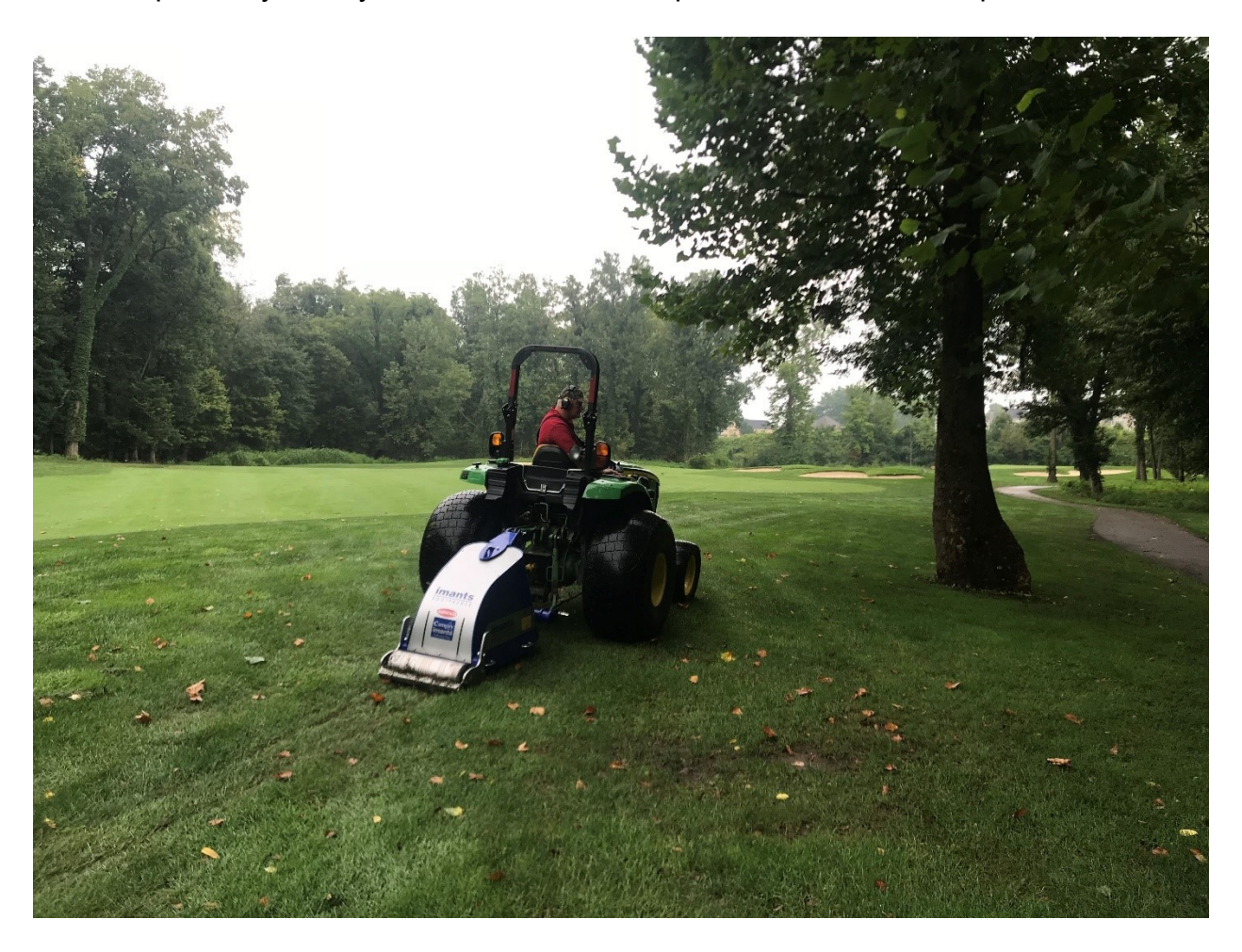
Figure 22. Pruning tree roots can help reduce competition for water and nutrients.

Conduct a tree survey that identifies each tree's location, species, health, life expectancy, safety concerns, value and special maintenance requirements.