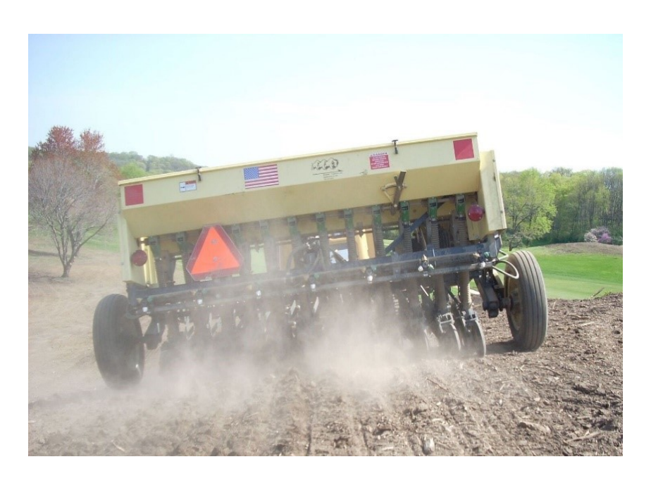
Figure 24. Turfgrasses must be scientifically selected for the eco-region of the golf course, resulting in minimized irrigation requirements, fertilization needs, and pesticide use.