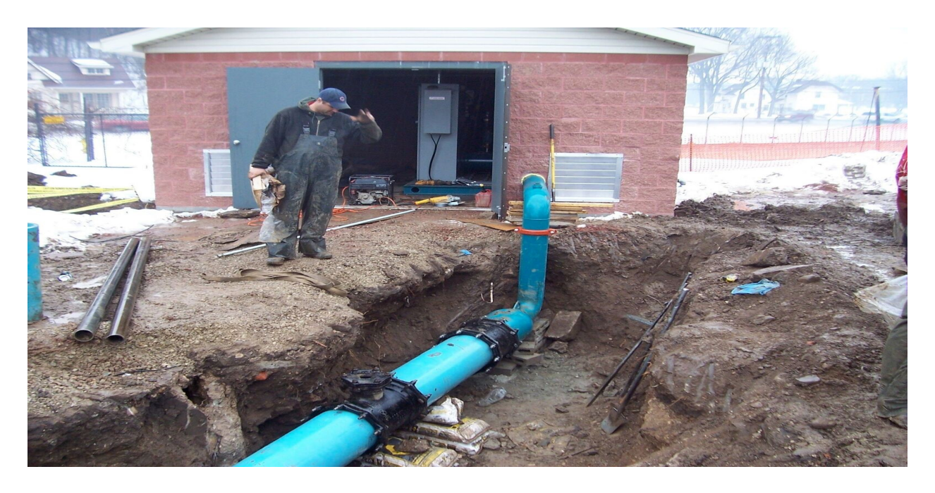
Figure 6. Properly designed and installed irrigation systems improve water use efficiency.