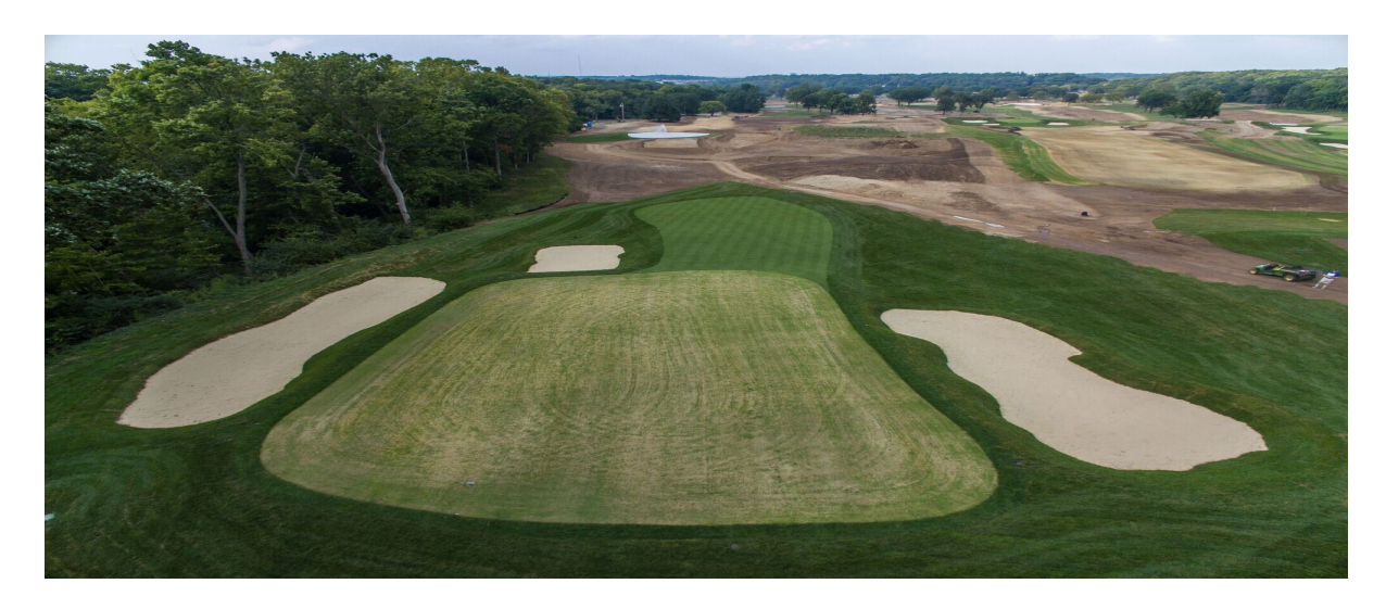
Figure 2. For proper turfgrass establishment, use appropriate seeding methods based on site conditions.

Turfgrass establishment is a unique phase in turfgrass growth, which can require greater quantities of water and nutrients than established turfgrasses. To this end, the establishment phase should be considered carefully to minimize environmental risk. Practices such as soil testing should be performed prior to seeding to determine the required amount of nutrients needed.