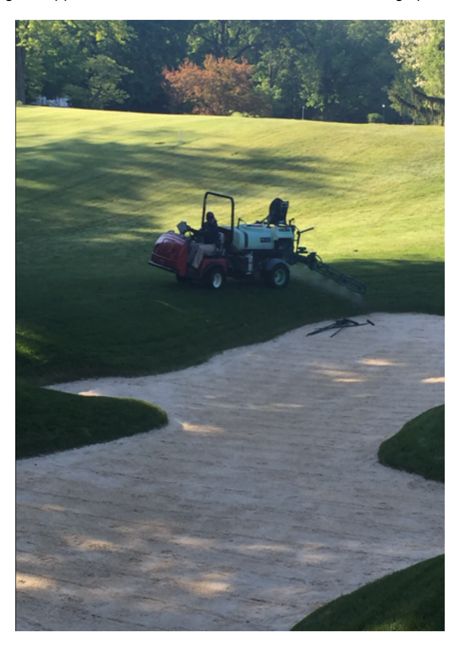
Figure 27. Properly calibrated application equipment is paramount to mitigating environmental and human health concerns.