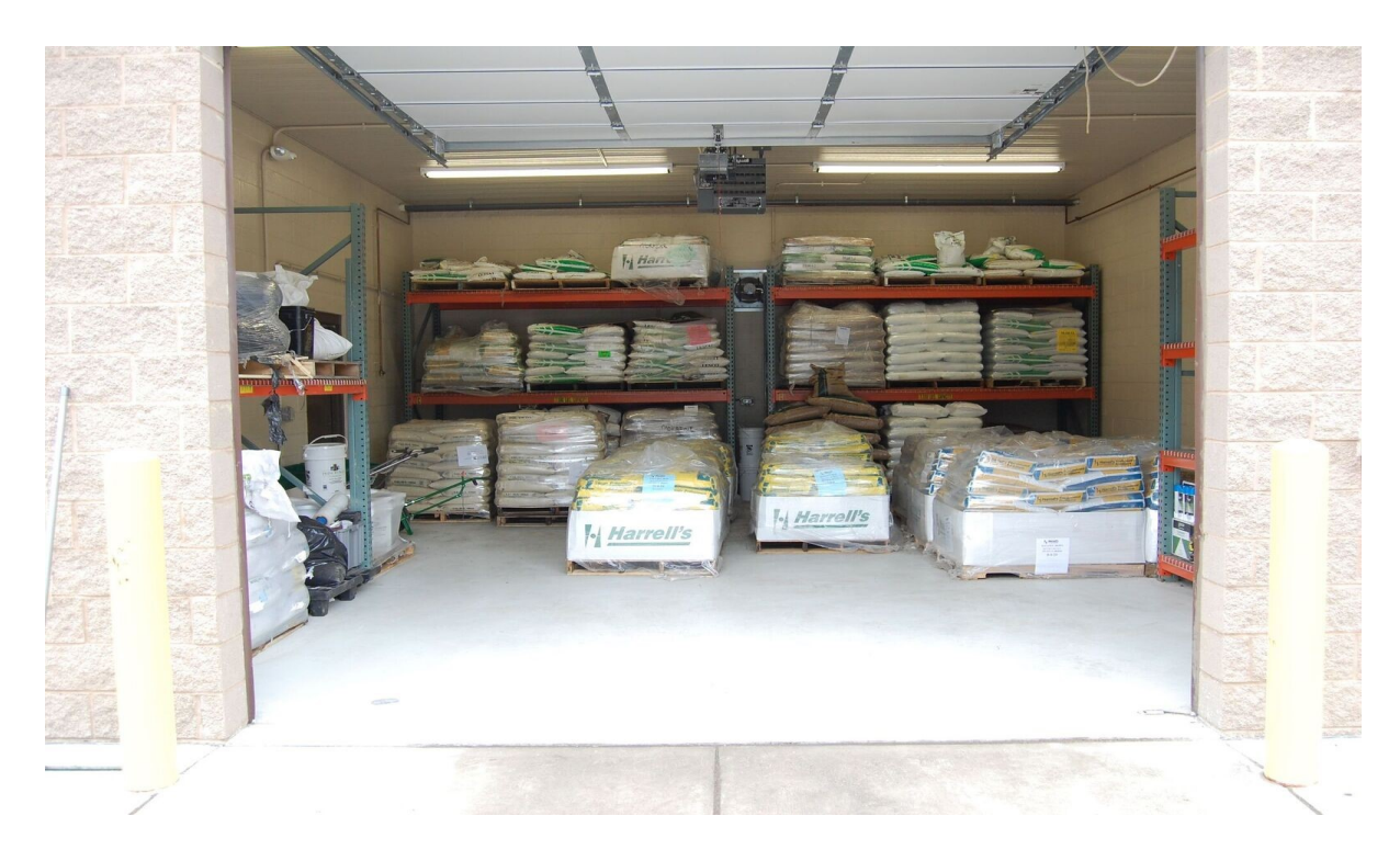
Figure 16. Understanding the components of fertilizers, the fertilizer label, and the function of each element within the plant are all essential in the development of an efficient nutrient management program.