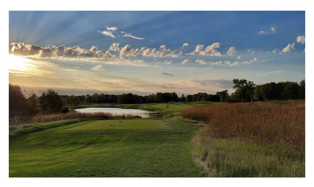
Figure 5. Selecting drought-tolerant varieties of turfgrasses can minimize water use.