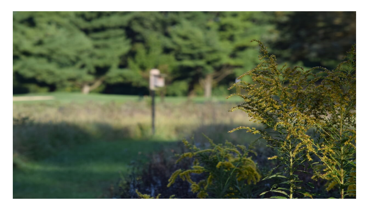
Figure 40. Planting native species such as Solidago (goldenrod) can help provide a diverse habitat for wildlife.