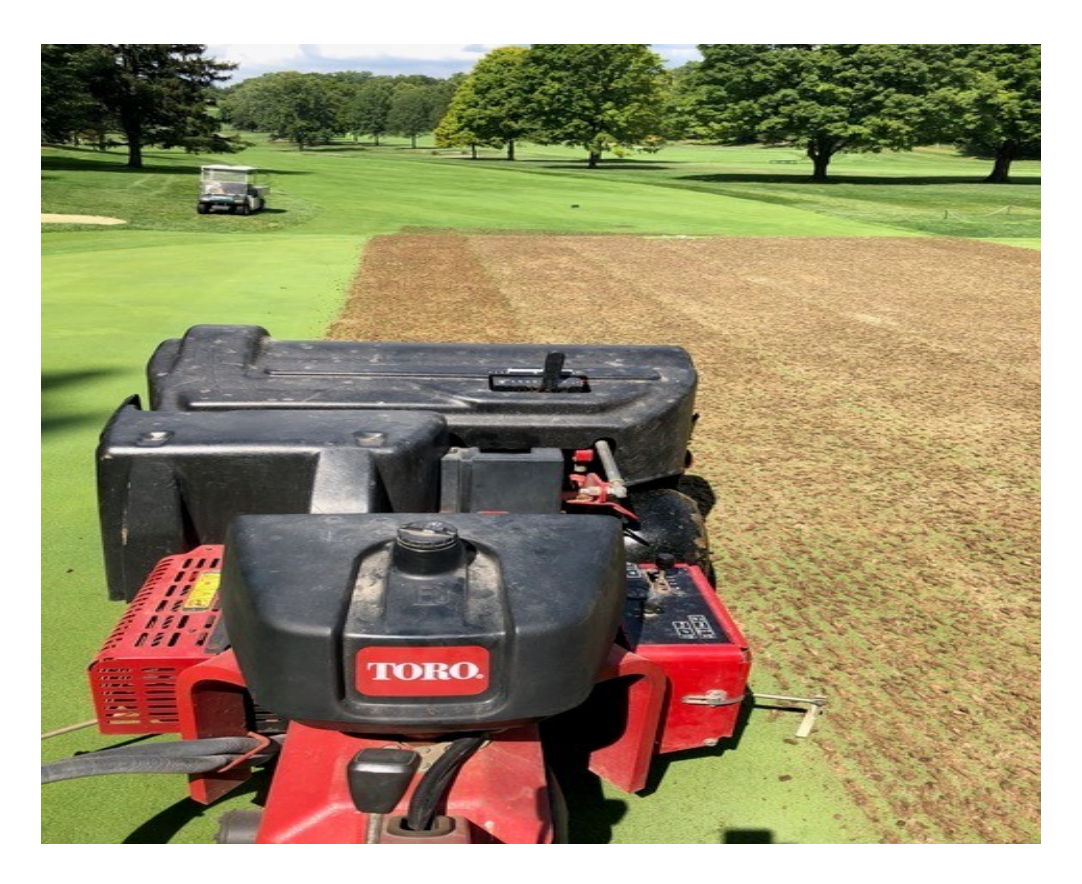
Figure 19. Core-aerification can improve playing surfaces and should only be completed when turf is actively growing. Photo credit: Ryan D'Autremont.