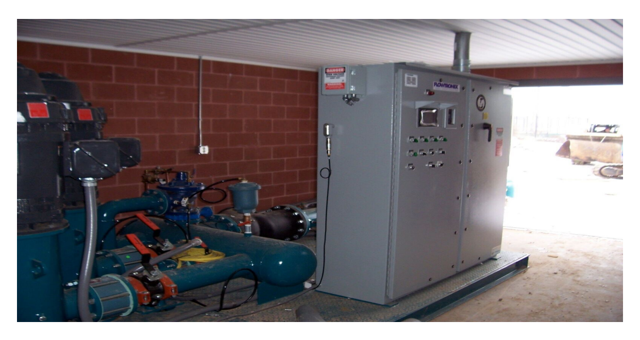
Figure 7. Pumps should be sized to provide adequate flow and pressure.