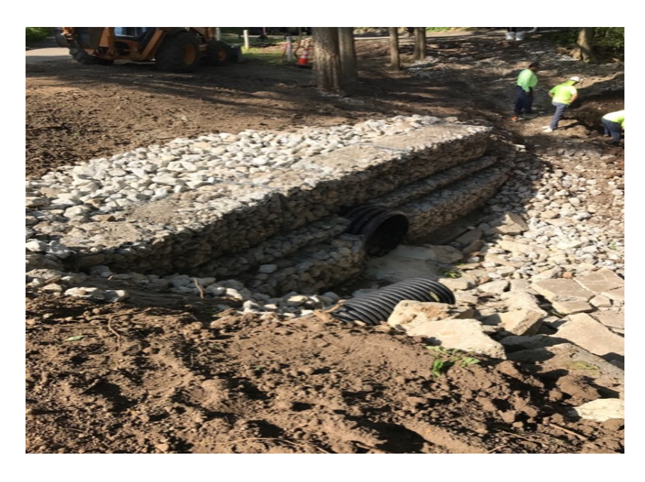
Figure 14. Use detention basins/catchments and water quality practices to buffer flooding and excessive runoff that may contain sediment.