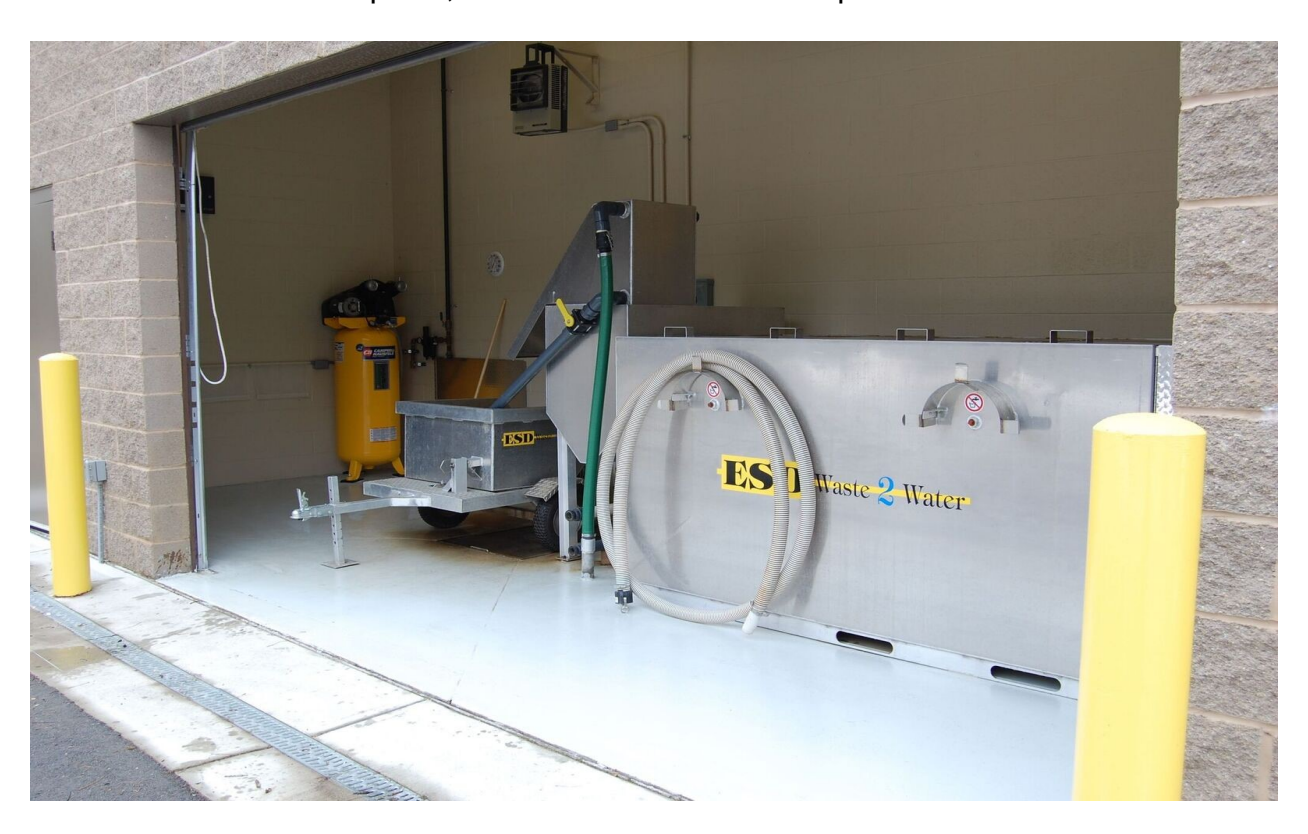
Figure 33. Wash equipment over a concrete or asphalt pad that allows the water to be collected.