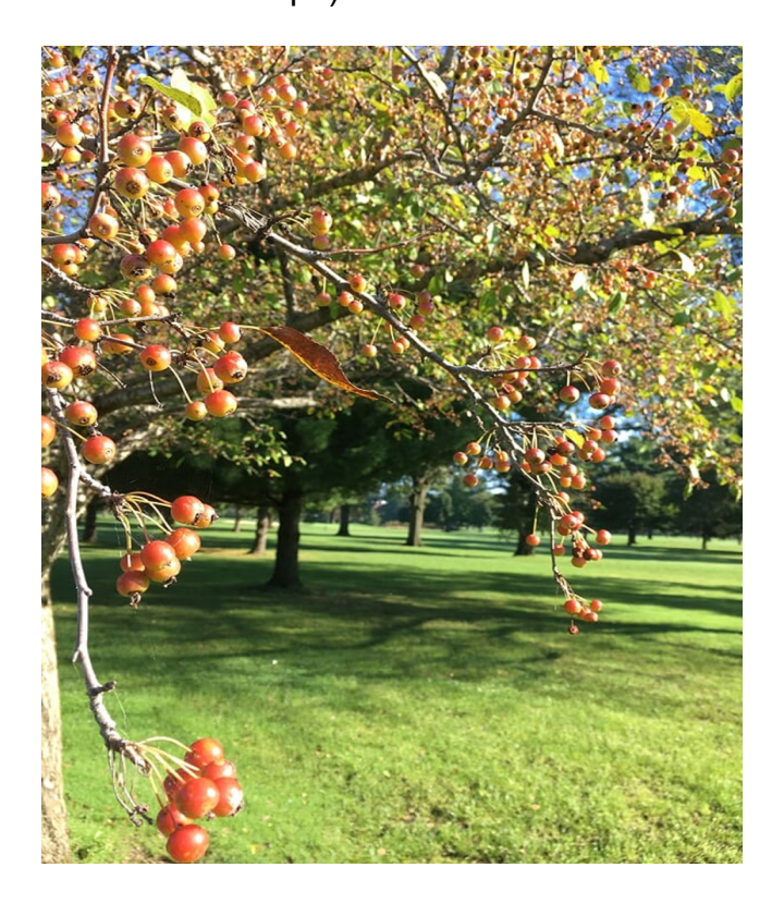
Figure 39. Utilizing tree and plant species with fruits and nuts help provide food to wildlife.

Selection should keep in mind the environment is ever-changing and selections should reflect environmental adaptations. (ex. Emerald Ash Borer's effect on the use of ash trees in the landscape).